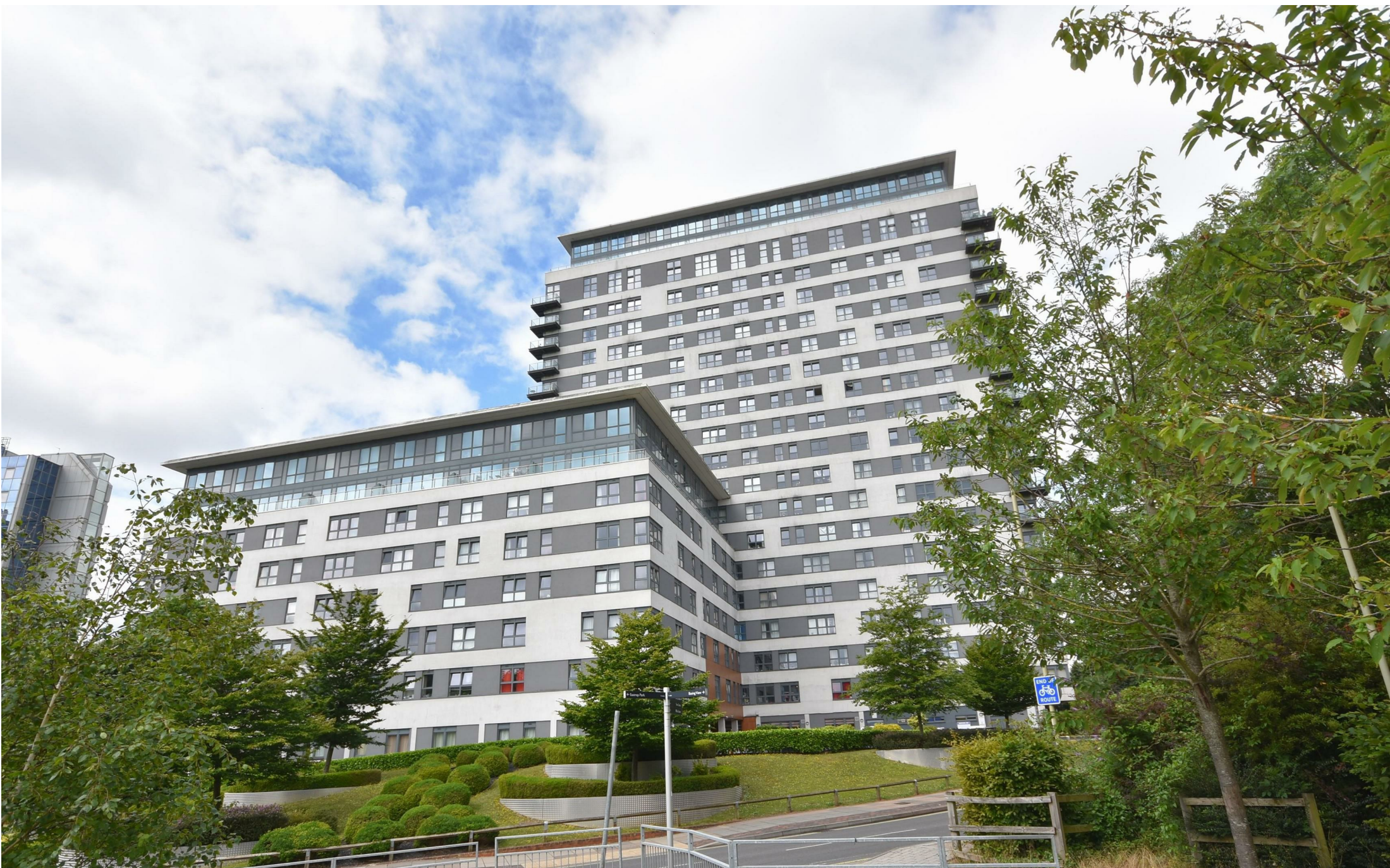
Skyline Plaza, Alencon Link, Basingstoke, RG21 7AX